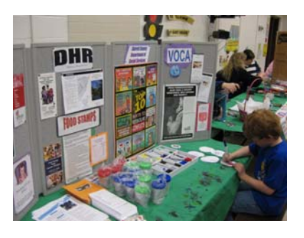
GCDSS Staff hosted fun activities at the 2011 Garrett County Kids First Fun Fair.